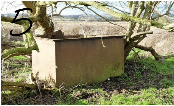
mull.ramps.slip (Water tank)