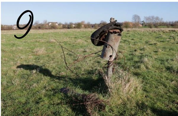
croaking.migrants.slip (Tyre sculpture)