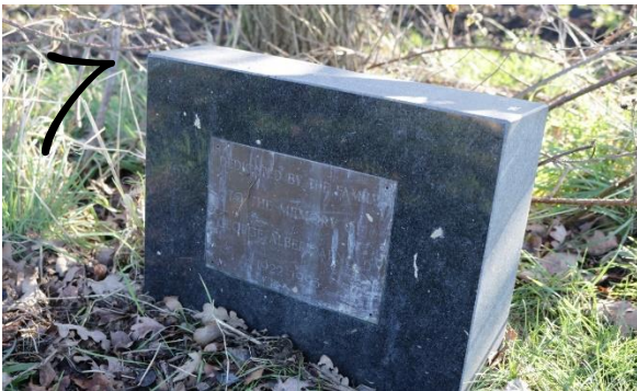
dots.footballers.workshops (Memorial Stone)