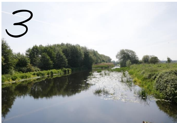
enclosing.listings.tinny (River to bridge)