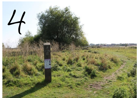
look.splendid.dimension (Post and tree)