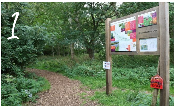
shrugging.kilts.marathons (Information board)

Please follow government guidelines and maintain social distancing while on the site.