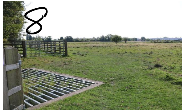
claims.nets.buyers (Cattle grid)