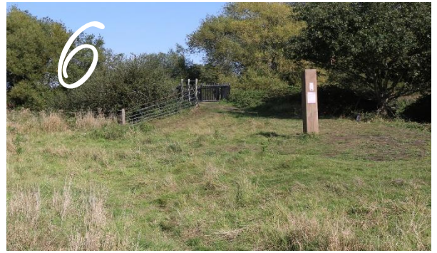
pinches.enlighten.blotches (Post and gate)