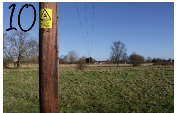
footpath.fish.frozen (Telegraph poles)